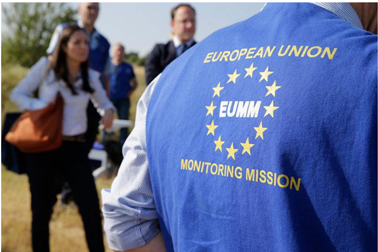
EU Monitoring Mission in Georgia

An example for the integrated approach is the EU's engagement in the Sahel where the objective is amongst other things to fight terrorism and trafficking.